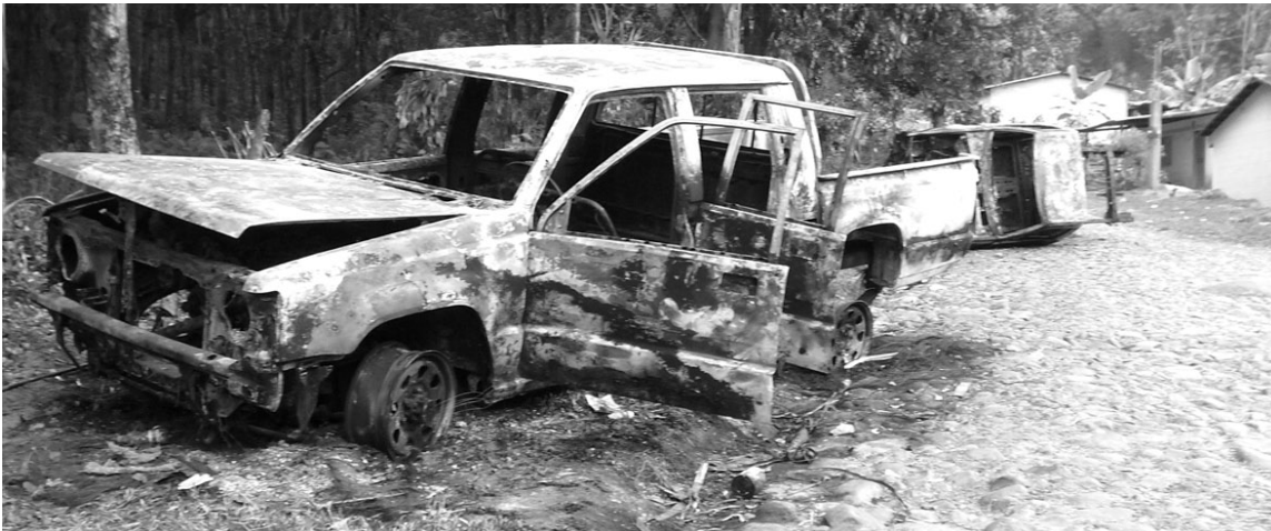
Bart Van Bael © 2010.