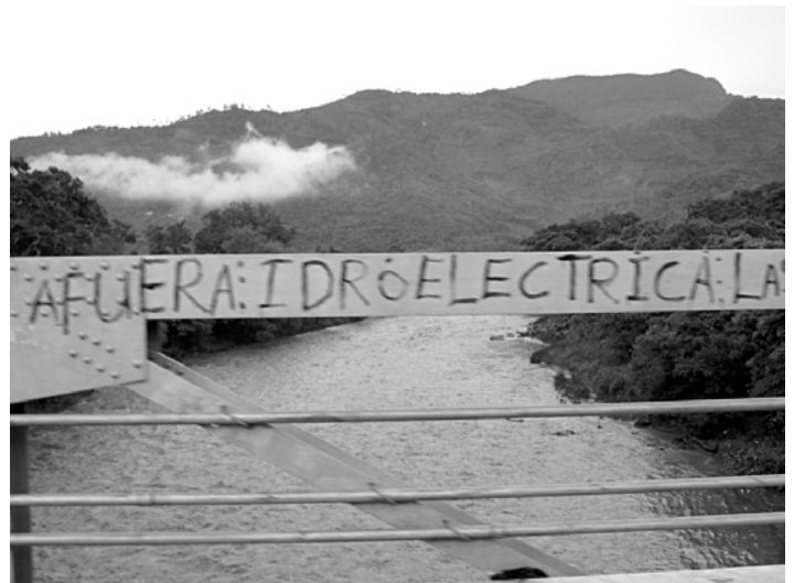
Graffiti against the hydroelectric plant painted on Jupilingo Bridge, Chiquimula

As long as there are no community consultations carried out in Chiquimula, the opinion of the Chortí people will be difficult to measure.