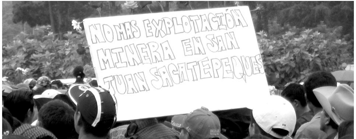
Banners of San Juan Sacatepéquez communities during protests in Santa Fe Ocaña.