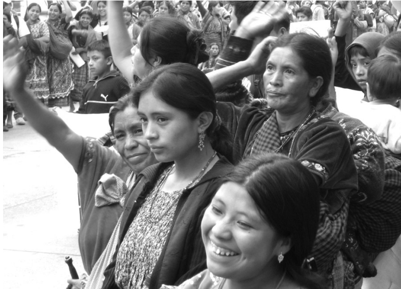
Kaqchiquel women from San Juan Sacatepéquez protest against the exploitation of natural resources during the Earth Day march in Guatemala City, 22 April 2010.

This article attempts to uncover the experience of Guatemalan women who have organised themselves in defence of their land. We will look at the strong bond between these women and Mother Earth and her natural resources, and at the impact that the extraction of these resources has on their lives. We will also look at the data relating to violence against women in Guatemala, gathered by national institutions and international organisations, which show women in a situation of greater vulnerability on account of their gender. Finally, we will speak about some of the achievements that have come of their struggle.